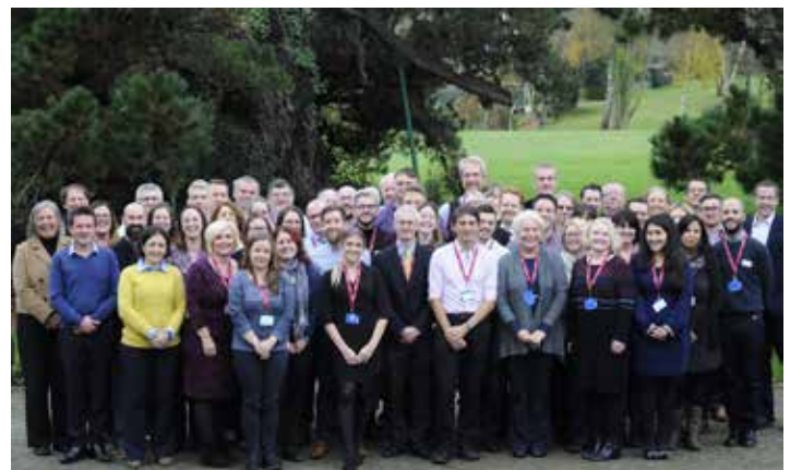
MY CARE Digital Transformation